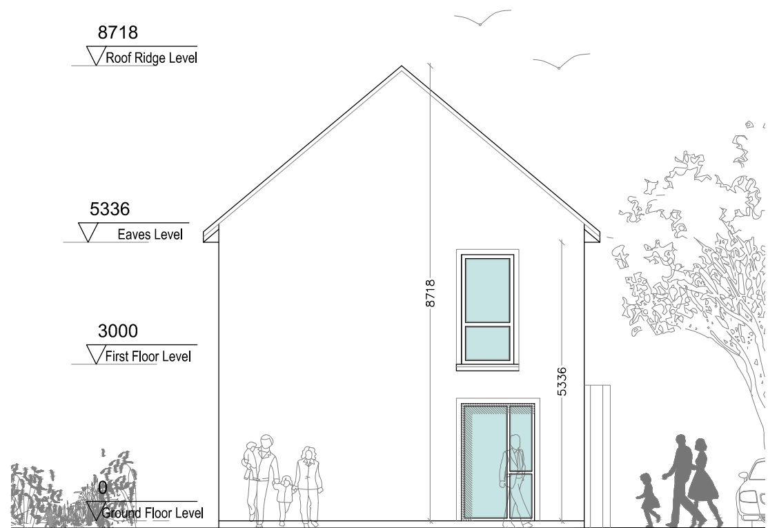
Proposed Side Elevation SCALE 1:100 @ A3

* FINISHED FLOOR LEVELS - REFER TO SITE LAYOUT PLAN