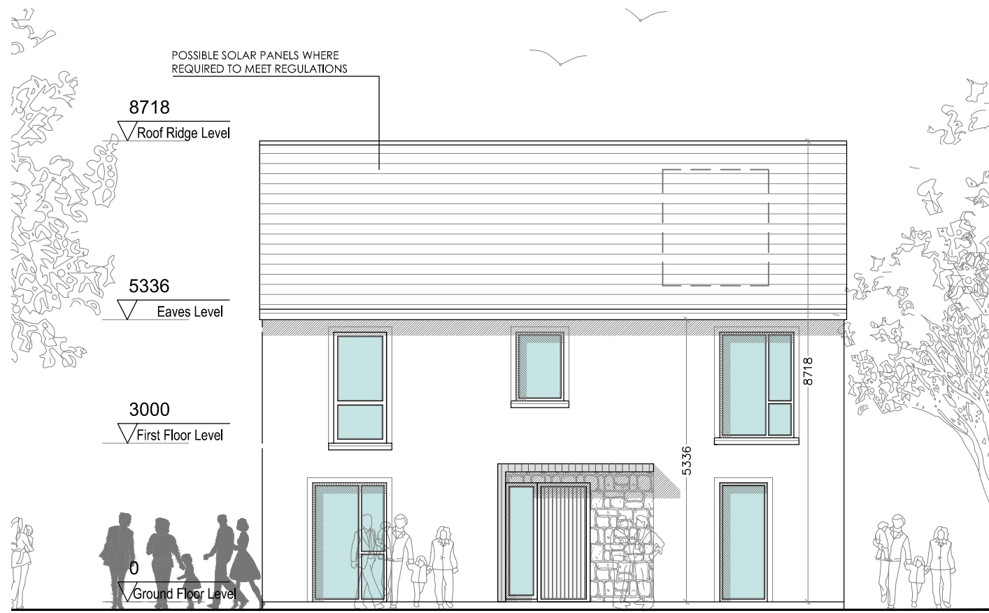
Proposed Front Elevation SCALE 1:100 @ A3

* FINISHED FLOOR LEVELS - REFER TO SITE LAYOUT PLAN